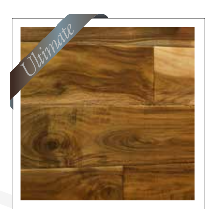
RENA280-L Natural Acacia