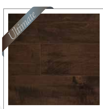
REOB250-L New York Birch