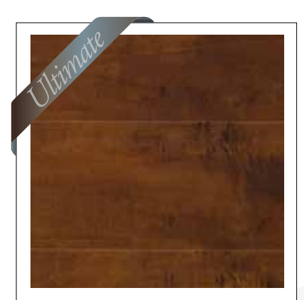
REOB230-L Oklahoma Birch