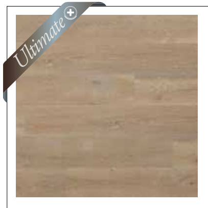
REFR1030 Saint Laurent