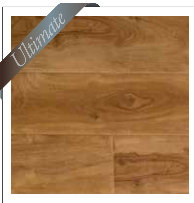
RERA210-L Rustic Apple