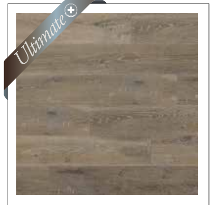
REFR1010 Saint Tropez