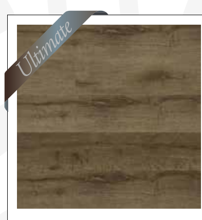
REET-950 French Gray