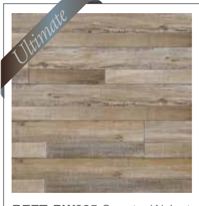
REET-BW885 Country Walnut