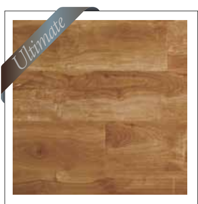
REGA220-L Golden Apple